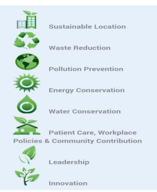
Fig 3. Standards of eco-friendly practice